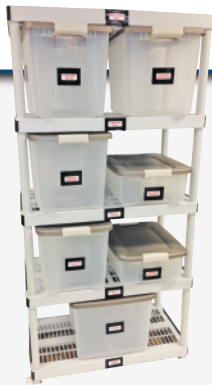
Shelving with Totes