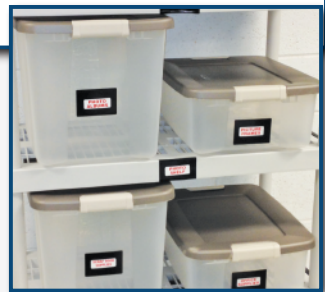
Shelving with Totes Closeup